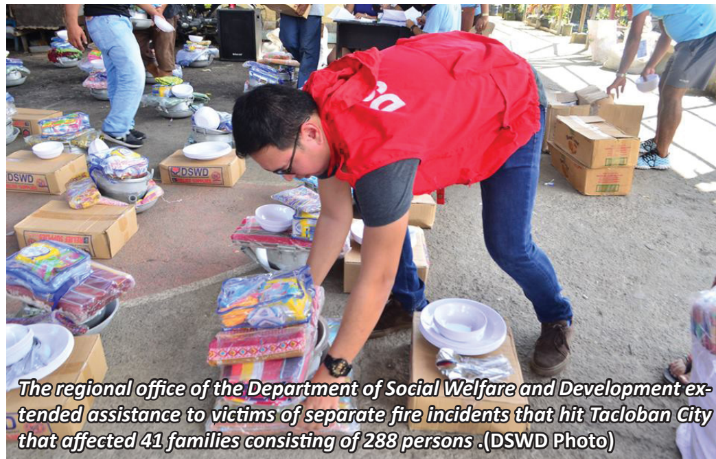
The regional office of the Department of Social Welfare and Development extended assistance to victims of separate fire incidents that hit Tacloban City that affected 41 families consisting of 288 persons.

Only a few days later, another fire broke out on November 16 at around 9:35 pm. Based on initial investigation, the fire was caused by an unattended candle at a boarding house at Brgy. 42, downtown. The fire also spread to