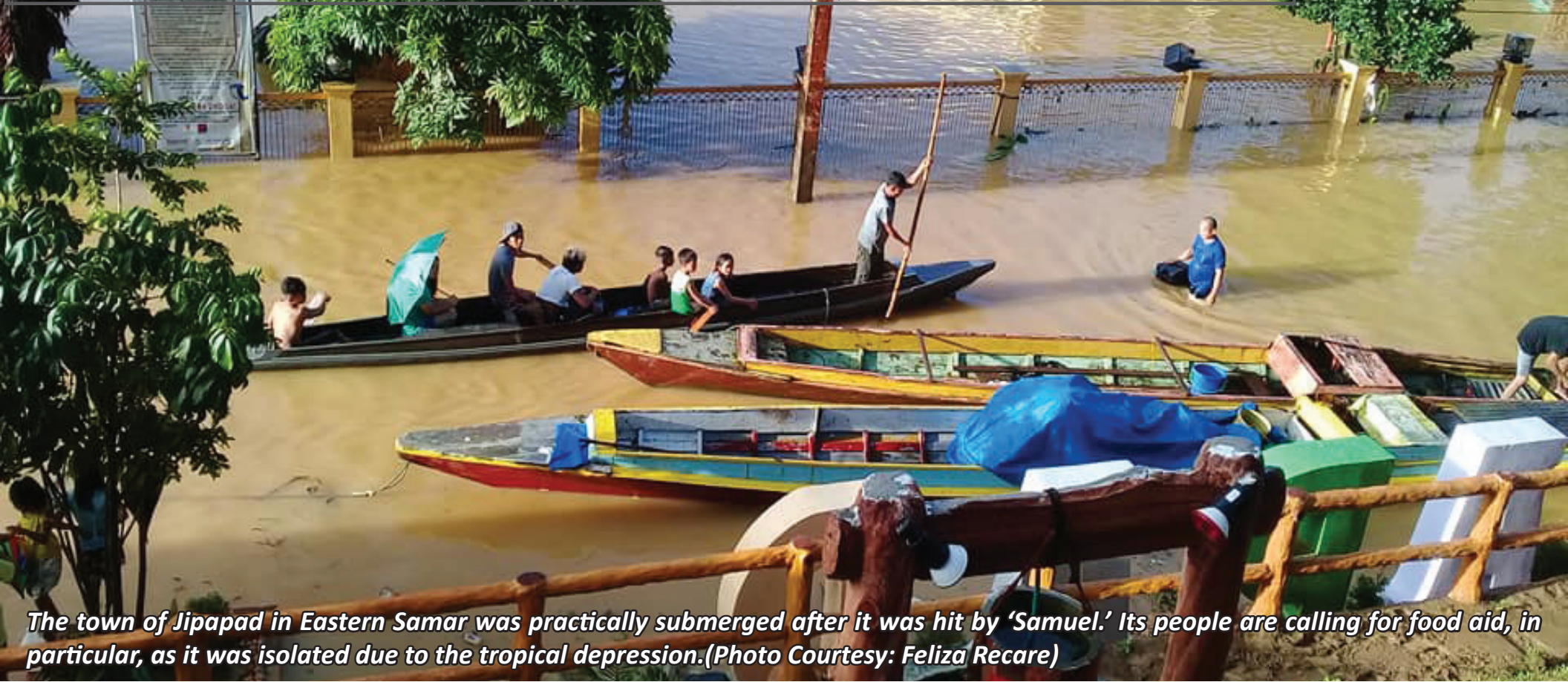
The town of Jipapad in Eastern Samar was practically submerged after it was hit by 'Samuel.' Its people are calling for food aid, in particular, as it was isolated due to the tropical depression.