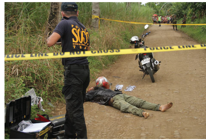
An alleged Muslim militant, engaged in gun running activity, was killed by police operatives during a buy-bust operation in Ormoc City on Thursday (Nov.22). (ROBERT DEJON)

ulga were two units of caliber .45 pistol, one improvised explosive device, P10,000 used to procure the firearm, and one motorcycle.