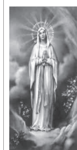
Pray the Holy Rosary daily for world peace and conversion of sinners (The family that prays together stays together)