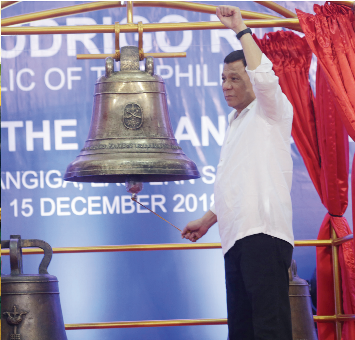
Lakas-CMD party president and former Leyte (1st dist) Rep. Martin Romualdez expresses gratitude to President Rodrigo Duterte at Daniel Z. Romualdez Airport in Tacloban City after he went to Balangiga, Eastern Samar to witness the turnover of the three historic bells on December 15. Mr. Duterte rung one of the bells before these were turned over to the St. Lawrence The Martyr Church.