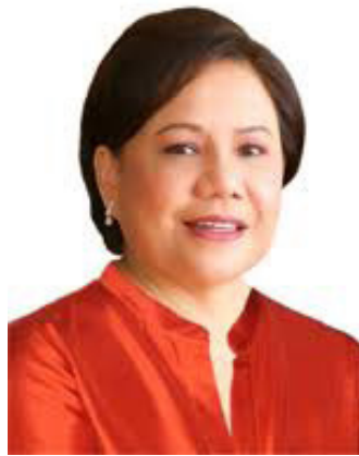
Senator Cynthia Villar

tiveros, and Laila de Lima, now detained for drug-related charges.