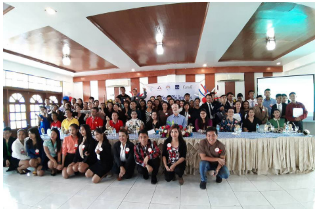
A total of 100 Jobstarter program trainees successfully graduated from the six-month full cycle training in this city last March 29.