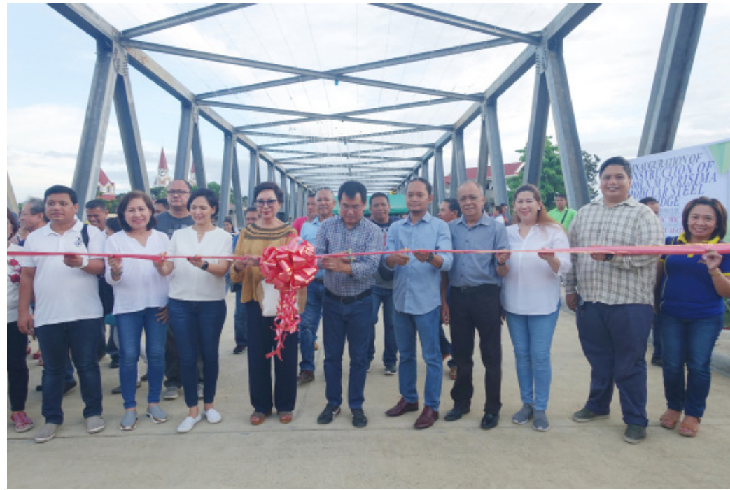
Leyte Governor Leopoldo Dominico ‘Mic’ Petilla and Palo Mayor Remedios ‘Matin’ Petilla led the cutting of the ribbon, inaugurating the construction of a 60.0 linear meter Purisima Modular Steel Bridge in the amount of P13.33 million funded by the Department of Interior and Local Government and the provincial government of Leyte. Joining Gov. Petilla and Mayor Petilla of the March 27 event were barangay chairman Artchie Yu of Guindapunan and mayoralty candidate, Ann Petilla, among others.