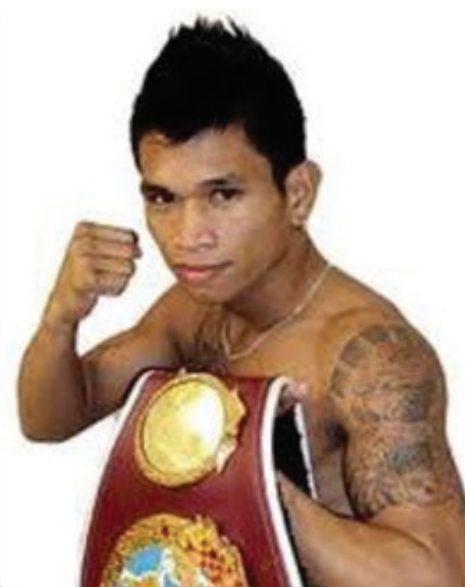
WBO interim bantamweight king Johnrirel Casimero (left) and WBA superbantamweight champ Nonito Donaire Jr.