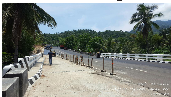
The widening of Looc Bridge in Almeria town worth P21.898 million is now completed. It serves the travelling public with at least an average of 500 vehicular users per day in this part of Biliran Circumferential Road (BCR)

“The completed project will increase the capacity of the existing roads and improves the safety aspect of