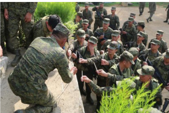
FALLEN COMRADES. Soldiers of the 43rd Infantry Battalion (IB) based in Lope de Vega, Northern Samar light candles to remember the heroism of fallen soldiers in commemoration of the National Heroes Day on Monday.