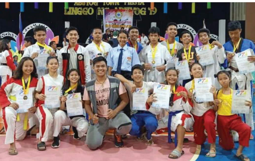
The Tacloban Jedi Knights celebrate after bagging the Junior's title in the Regional Taekwondo games in Abuyog, Leyte.