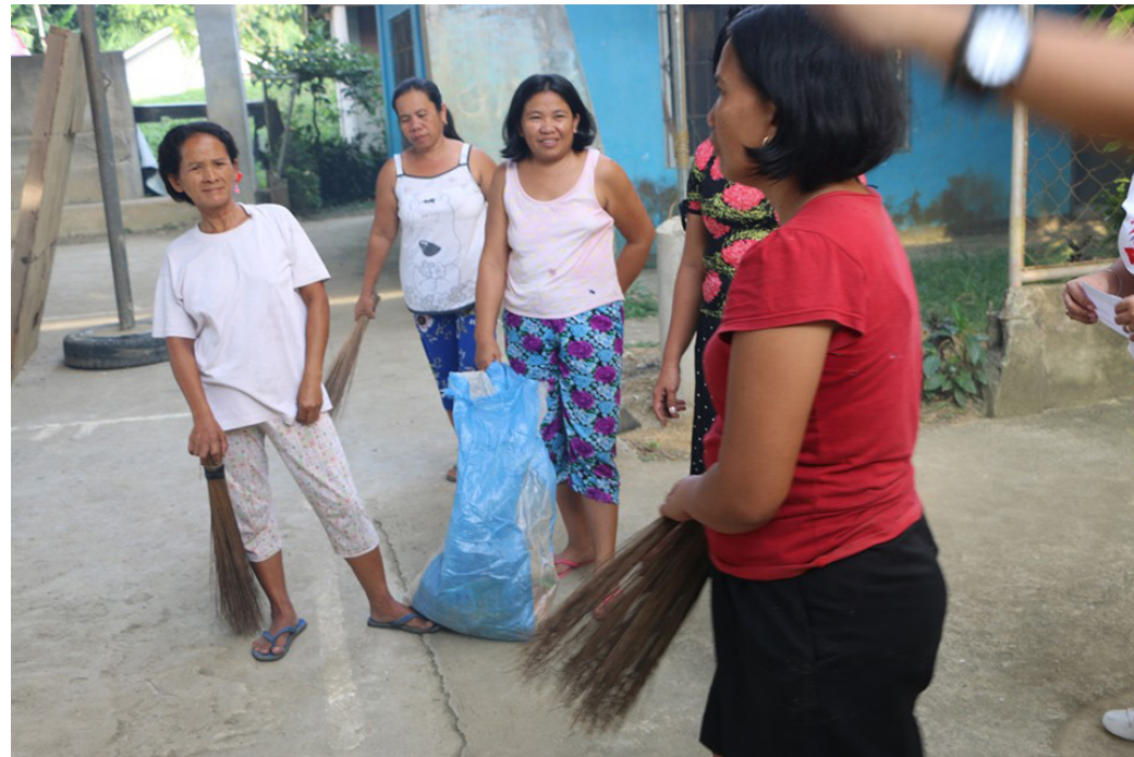
A city-wide cleanup drive was conducted across the city, particularly in areas where there are high cases of dengue fever, on Saturday. Mayor Alfred Romualdez has expressed his alarm on the high number of dengue fever cases of Tacloban City reason why he directed for a house-to-house campaign.

"If there is a problem, we can solve it by talking and discussing it to find way of addressing the concern. The main goal is to share information about the project implementation with funding from DILG, and this is one of way to strengthen awareness to the government projects. This is a form of information sharing," he added. The DILG top executive also requested media to become advocate of the Seal of Good Local Governance (SGLG). "Talk with your local officials and tell them to do their job so that they pass the SGLG," he said. According to him, the monetary prize the come with the award is 'insignificant' but the SGLG seal could become a 'bragging right' for them. The (SGLG) originated from the Seal of Good Housekeeping (SGH) which is the department's response to the clamor of the people for integrity and performance in public service. It challenges local governments to continue good governance practices while providing better public services. SGLG awardees are given opportunity to have a share at the Performance Challenge Fund, multimillion-peso incentive for local development projects. In Northern Samar, three LGUs passed the evaluation for SGLG award this year. These are the municipalities of San Roque, Lavezares, and Gamay.