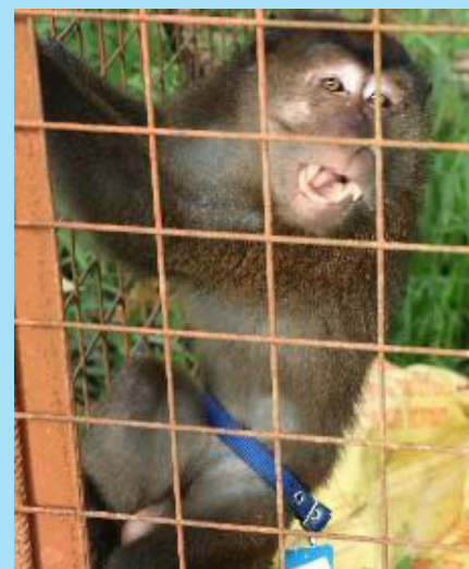
The rescued monkey inside the cage at the Regional Wildlife Rescue Center for assessment and rehabilitation.