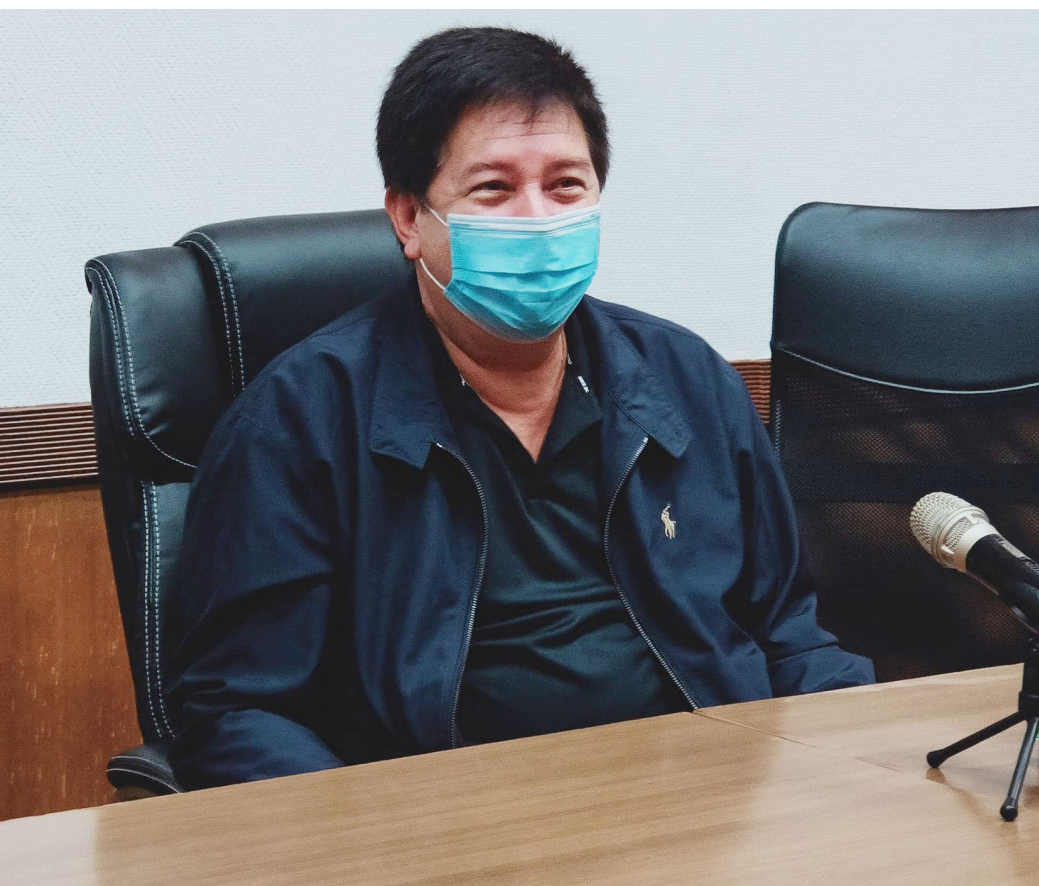
GUINEA PIG. Tacloban City Mayor Alfred Romualdez said that he is willing to be a guinea pig in so far as receiving shots of the anti-COVID vaccines to show the effectiveness of the vaccines. The city mayor has just recovered from the dreaded virus.