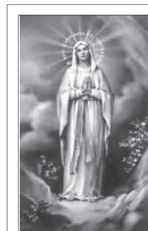
Pray the Holy Rosary daily for world peace and conversion of sinners (The family that prays together stays together)

But in the end, humans are adaptable organisms and come Pandemic and High Water, they will thrive. Thus let me offer