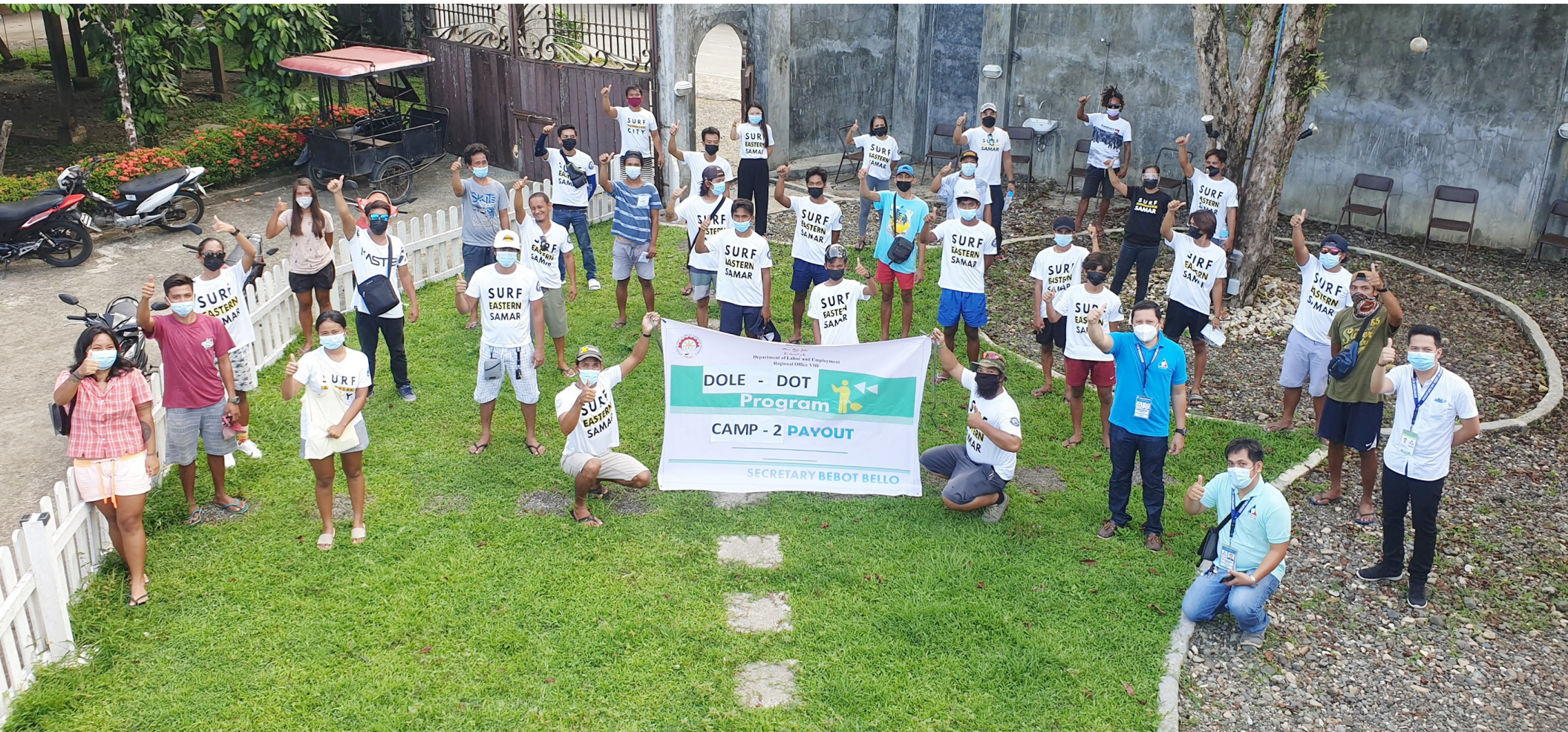
Surfers from Borongan City received financial assistance from the Department of Tourism and the Department of Labor and Employment. The assistance was aimed to help the surfers hit by the COVID-19 pandemic.