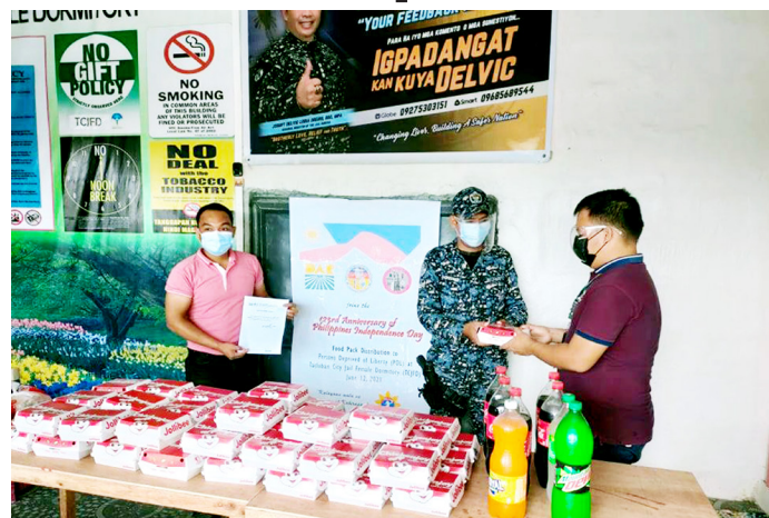
The Department of Agrarian Reform (DAR) Regional Office-8 provided food packs and drinks for the persons deprived of liberty (PDLs) confined at the Tacloban City Jail Female Dormitory on Independence Day.