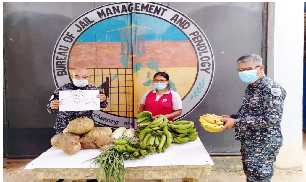
The Department of Agrarian Reform (DAR) Eastern Samar Provincial Office provided fruits and vegetables for the preparation of the meal for the persons deprived of liberty (PDLs) confined at the Borongan City Jail, Guiuan and Balangiga District Jails on Independence Day.