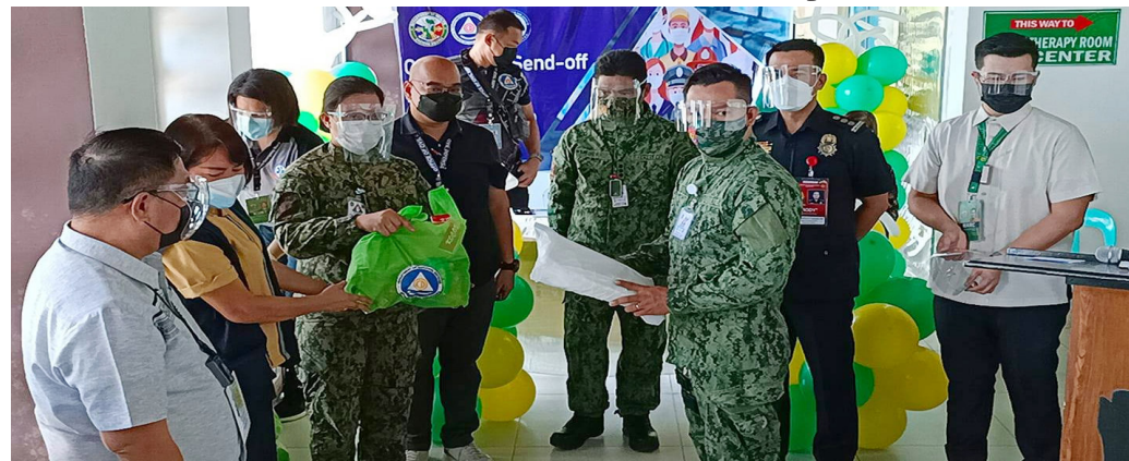
DEPLOYMENT. As Tacloban City continues to experience surge of coronavirus disease (COVID-19), the Department of Health and the Regional Task Force on COVID-19 has deployed 27 medical reserve personnel coming from the Philippine National Police and Bureau of Fire Protection to different hospitals to include Eastern Visayas Regional Medical Center.

House Majority Leader and Lakas-CMD Party President Martin Romualdez is not closing his doors on the 2022 national elections, as he expressed gratitude to President Rodrigo "Rody" Duterte for the surprise endorsement of him as vice presidential candidate in the 2022 elections.