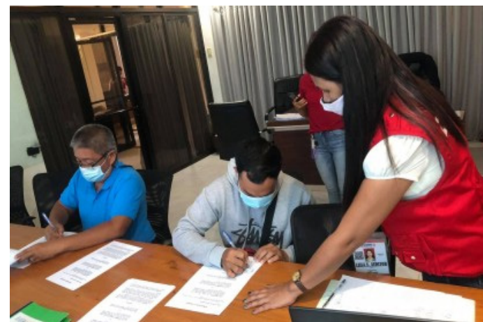
BALIK PROBINSIYA AID. Beneficiaries sign documents during the turnover of transitory support package to Balik Probinsya, Bagong Pag-asa (BP2) program recipients in Leyte province on June 15, 2021. The cash assistance is given to the family beneficiaries to support their food and other basic needs during their transition period in their hometowns.

Institutionalized under Executive Order 114, series of 2020, the BP2 program is an initiative of the national government created to