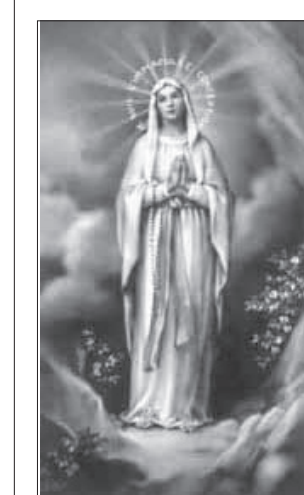
Pray the Holy Rosary daily for world peace and conversion of sinners (The family that prays together stays together)

Commentaries from readers whose identities they prefer to remain anonymous can be accommodated as "blind items". It will be our editorial prerogative, however, to verify the veracity of such commentaries before publication.